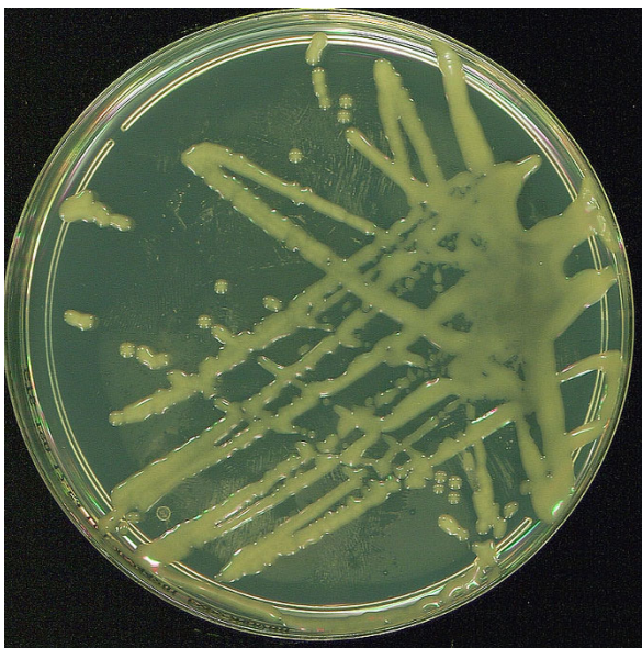
Figure 2 Appearance of Corynebacterium mucifaciens colonies obtained in 24 h of incubation: circular, mucoid, slightly yellowish and about 2 mm rods.

positive, showed a positive reaction for pyrazinamidase, pyrolidonyl arylamidase, alkaline phosphatase, and acid production from glucose and maltose, were negative for oxydase, nitrate reduction, and urease. By this time, the attempt to identify the organism gave the numerical code 6100125 which corresponded, according to the system's database with the identification of Corynebacterium striatum/amycolatum with 88.7% similarity. Subsequently, a second API corynesystem was realized