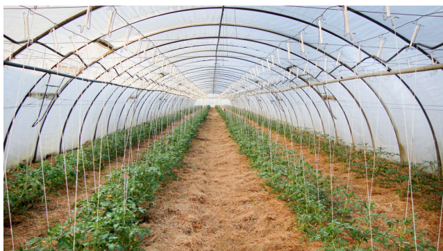
Fig. 1 Regional organic tomato cultivation in unheated plastic tunnels in Austria

practices (Lindenthal et al. 2010; Meisterling et al. 2009). Some research has been conducted to systematically compare the environmental burdens resulting from the entire tomato supply chain to the retailer in a manner that integrates agricultural production, including its upstream requirements, with those of the transport chains (Roy et al. 2008; Sim et al. 2007; Blanke and Burdick 2005; Andersson et al. 1998).