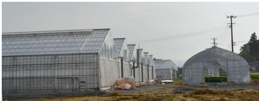
Fig. 5.2 Linked strawberry greenhouses ( left ) and seedling greenhouse ( right ) constructed using a recovery grant