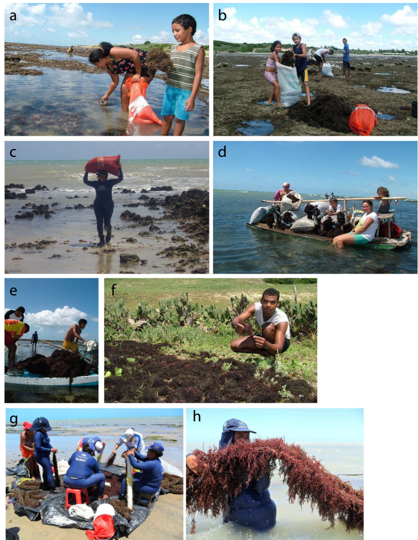
Fig. 3 Brazil. Harvesting and aquaculture in the community of Rio do Fogo, Rio Grande do Norte, Brazil. (a–b) Women and their children harvesting the natural bed of seaweeds at low tide. (c–d) Gathering of the seaweed in bags. (d–e) Harvesting of the seaweed by boat. (f) Sun-drying of the seaweeds. (g) Preparation of the seaweed seedling net by the women of the community. (h) Culture line of Gracilaria birdie