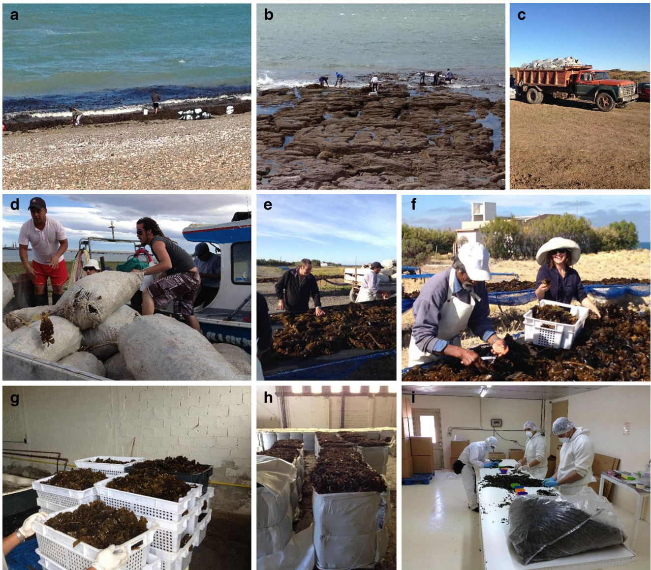
Fig. 1 Argentina. Harvesting of seaweed in Patagonia. (a) Beach-casted seaweed is harvested. (b) Seabed of U. pinnatifida is harvested at low tide. (c) Transport in truck of the harvest biomass to the drying site. (d) Algae are harvested in nets. (e) Suspended net for drying the U. pinnatifida .

In Mexico, the federal government manages all fisheries. However, under a law published in 2009, individual states can