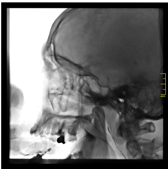
Fig. 2 A-27-gauge dental needle was 60° tilted and inserted from 1 cm anterior and 1 cm medial position from the 3rd molar area. Needle was passed through from palatini major and it was forwarded to superior-posterior direction for an average 2 cm distance

17.0 was used for analysis (Statistical Package for the Social Sciences, version 17.0, SSPS Inc. Chicago, IL, USA).