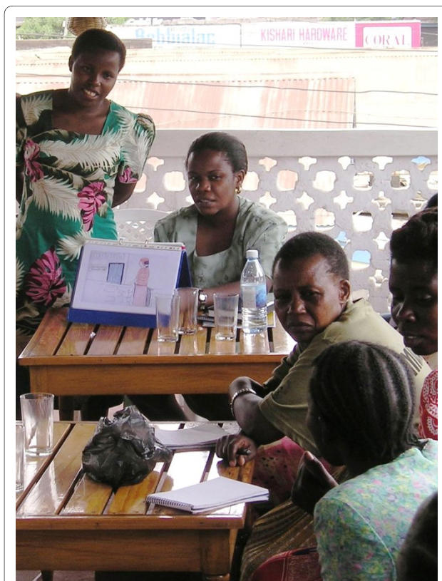
Figure 2 Reviewing an early version of the pictorial flipchart with CAC members.

These findings led to a reappraisal of informed consent procedures at the site, culminating in a variety of new approaches being tested in the MDP301 Pilot Study, including a pictorial flipchart developed through consultation with members of the Community Advisory Committee (Figure 2) and subsequently used by project fieldworkers to provide information to potential study participants at facility-based community meetings. Audio tape recordings and pictorial instructions providing information on gel use were also piloted. A site-specific comprehension assessment, which included a qualitative component and a standardised written checklist, was used to evaluate how accurately study participants were able to retain key messages relating to pilot study objectives. IDIs were conducted in order to explore comprehension and message retention in more depth. The high levels of information retention and comprehension observed during the pilot study led to a revised package of informed consent tools and procedures being taken into the main MDP301 phase III clinical trial.