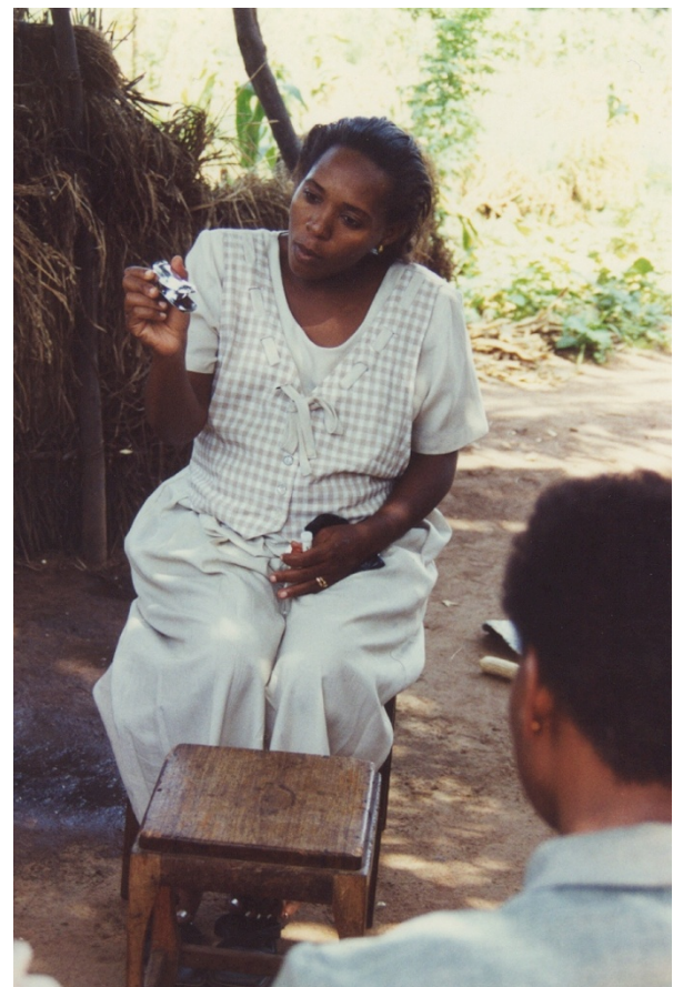
Figure 1 Fieldworker showing a speculum to women attending a facility-based meeting.

The relatively high early losses to follow-up observed during the feasibility study[25], coupled with anecdotal feedback from clinic staff and fieldworkers, and information collected from study participants in community participatory workshops, focus group discussions (FGDs) and in-depth interviews (IDIs) [34], suggested that mis-