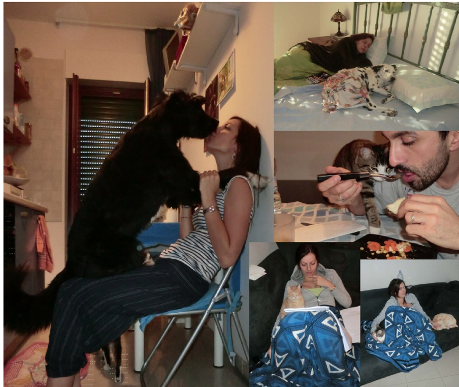
Figure 5 Close contact between privately owned pets and their owners. Although this behavior can be questionable, it cannot be considered at risk of infection with zoonotic nematodes for the owners.

that standard hygiene measures reduce at minimum the risk of acquiring zoonotic infections in this particular category [215,216].