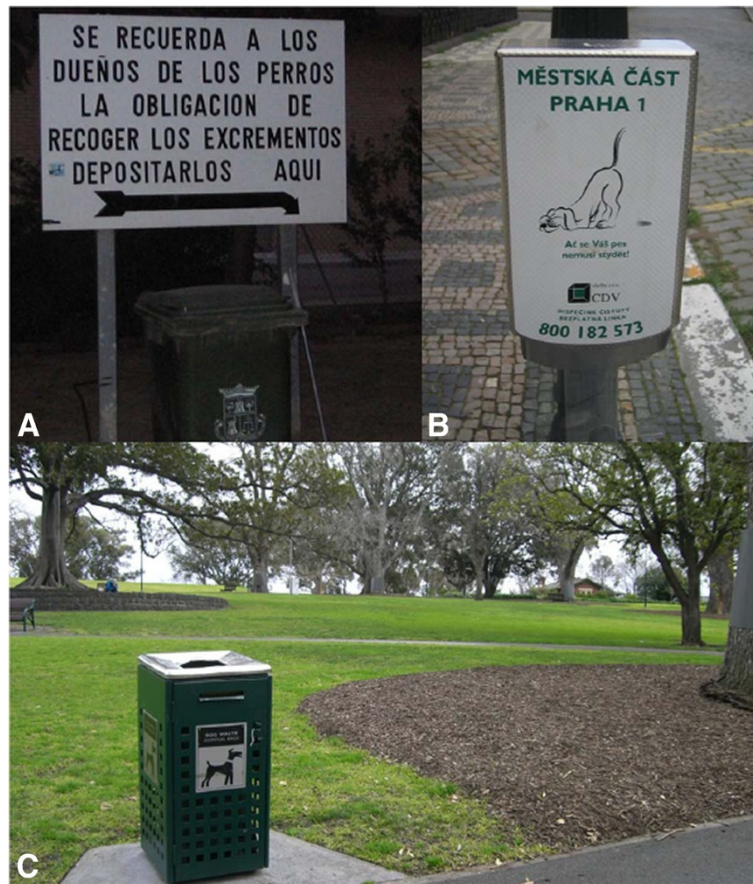
Figure 4 Dog-reserved areas and indications for pet owners in public areas in Valencia, Spain (A), Praha, Czech Republic (B) and Melbourne, Australia (C).

between the pet and the owner, even when some behaviour can be questionable (Figure 5). Actually, it is established that direct contact with infected pets presents no relevant risk in the transmission of intestinal nematodes and there is no association between pet ownership and infection occurrence [78,79]. Owners should have confidence that ownership of any companion animal is beneficial and safe as long as their pets are healthy [18]. Pet owners enjoy a plethora of advantages by living with dogs and/or cats. For instance, children, the elderly and disabled persons particularly benefit from their contact with a beloved pet. Companion animals represent a way of life for a lot of the people and this relationship provides socialization, mental health, and physical well-being: those who own a pet have been shown to display reduction in blood pressure and cholesterol levels, require less medical care, and it has also been reported that there is an improvement of life quality and quick recovery after heartbreaking events [209-213]. Therefore, owning companion animals is vital for the majority of families, especially when children and the elderly are