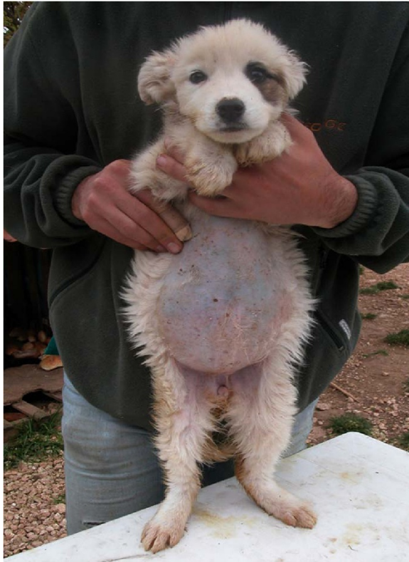
Figure 1 Pot belly in a roundworm-infected puppy.

dysbacteriosis and gas formation. In severe circumstances animals may suffer from thickened intestine, partial or total obstruction or occlusion, duodenum dilatation, peritonitis, bile and pancreatic ducts blockage, rupture of the intestine and worms at different stages expelled with the vomitus or the faeces (Figure 2); indeed, pups and kittens with heavy infections may expel a large mass of worms in vomitus [13,16,20,27], thus causing distress for the owner as the