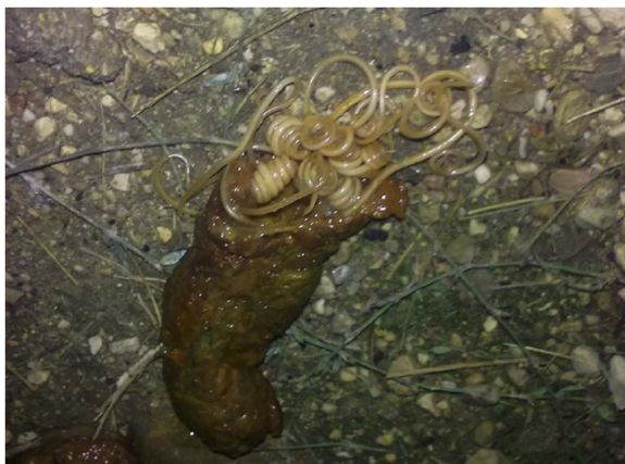
Figure 2 Adults of Toxocara canis spontaneously expelled with the faeces by a puppy.

dysbacteriosis and gas formation. In severe circumstances animals may suffer from thickened intestine, partial or total obstruction or occlusion, duodenum dilatation, peritonitis, bile and pancreatic ducts blockage, rupture of the intestine and worms at different stages expelled with the vomitus or the faeces (Figure 2); indeed, pups and kittens with heavy infections may expel a large mass of worms in vomitus [13,16,20,27], thus causing distress for the owner as the