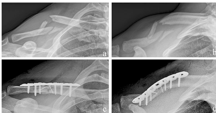
Fig. 3 Radiological outcome of a clavicle midshaft fracture OTA B2.3 (patient 11, MOP group). (a) + (b) preoperative; (c) + (d) postoperative

In the present study we introduce our recently developed technique for MOP of clavicle fractures. We found a significantly reduced anterior chest wall numbness in comparison to a conventional open approach. Pain showed no clinical or statistical significant difference in the MOP group in comparison to the COP group in the first 14 postoperative days.