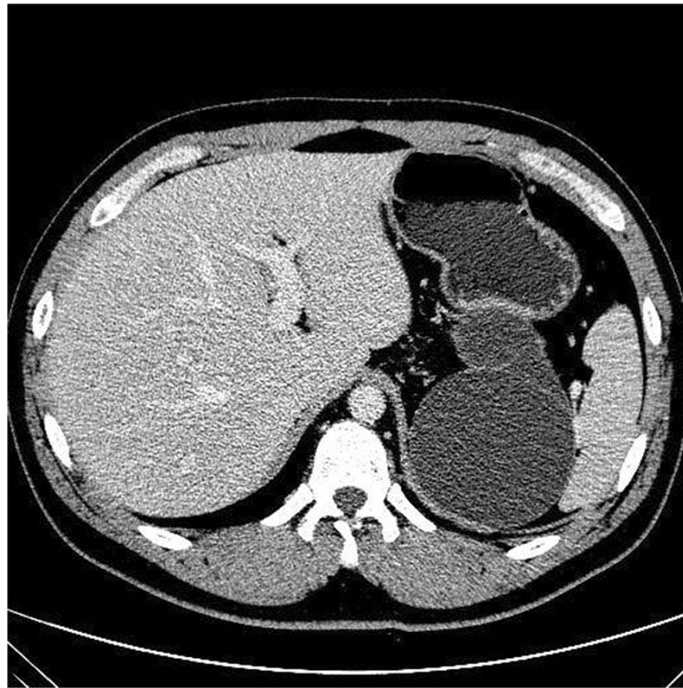
Figure 1 Computed tomography of the abdomen (with contrast agent). A well-defined oval lesion is seen immediately adjacent to the gastric corpus and left adrenal gland area. A linear septum can also be seen.

lesion en bloc were not successful, and the lesion ruptured with the fluid contaminating the peritoneal cavity. The cystic lesion was removed grossly, and gross pathological examination showed a ruptured 7 \times 6.5 \times 4 cm irregular cyst with two cavities. Microscopic examination showed typical gastric mucosa with a smooth muscle component in the wall of the resected cyst with no malignancy (Figure 2). Therefore, a gastric duplication cyst was diagnosed based on the images and histology.