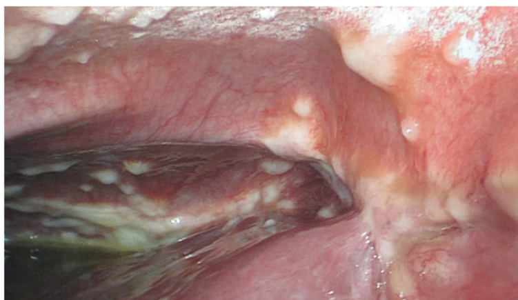
Figure 3 Diagnostic laparoscopic examination showing multiple white nodules on the surface of liver and peritoneum.

Gastric duplication cysts are typically found in the greater curvature of stomach and always manifest as non-communicating oval cysts [2]. The symptoms are usually not specific and include abdominal pain, vomiting, and weight loss [5]. Some patients experience acute onset of bleeding and pancreatitis [6-8]. In a study of 83 patients with gastric duplications, Pruksapong et al. [5] reported more than 50% cases with manifestations of a palpable abdominal mass (55/83) and vomiting (53/83). Vomiting is usually explained by partial or complete obstruction of the gastric outlet [9].