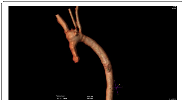
Fig. 3 MRI 3D aortic arch reconstruction showing severe hypoplasia and multiple aneurysms of ascending aorta, extending till first brachiocephalic artery; sinotubular junction is also severely stenotic

Surgical outcome is heavily influenced by the presence of coronary tree anomalies (Eronem et al. 2002; Imamura et al. 2010; Hornik et al. 2015). As a consequence, pre-operative coronary tree evaluation is mandatory in all patients with WBS (Imamura et al. 2010).