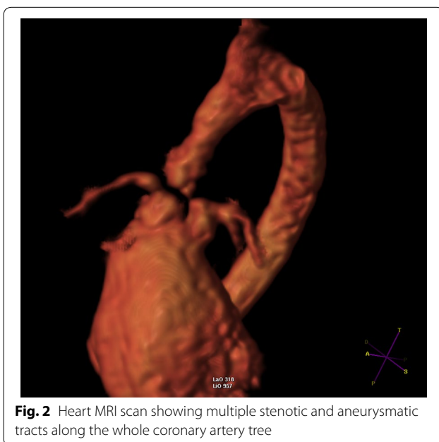
Fig. 2 Heart MRI scan showing multiple stenotic and aneurysmatic tracts along the whole coronary artery tree

At the end of the diagnostic process, the surgical plan included aortic valve replacement and annulus enlargement by Konno procedure (aortic annulus 14 mm), SVAS repair including coronary ostia, aortic arch repair including carotid arteries and three coronary artery bypass grafts. However, surgical mortality calculated with