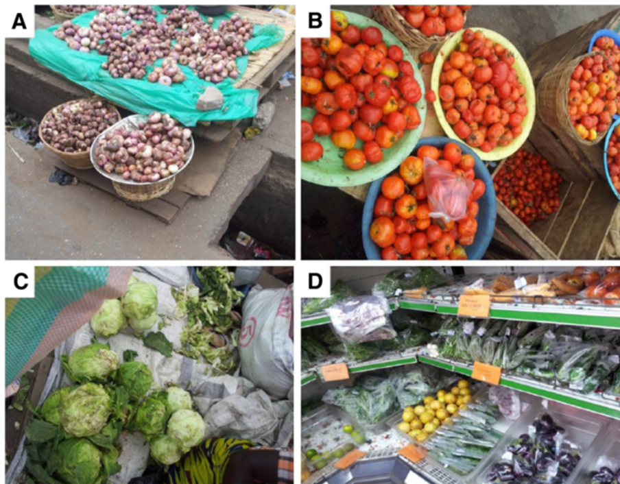
Figure 1 Sample collection sites and forms of display. Forms of which vegetables are displayed for customers to purchase. Onions (A), Tomatoes (B) and Cabbage (C) as sold in the open markets. In the supermarkets (D), vegetables are displayed and sold differently in visibly clean forms.

although the variances differed significantly ( p < 0.0001 ). There was a significant difference between the mean ( p = 0.017 ) and variance ( p < 0.0001 ) of parasites encountered at the various markets. Very low prevalence of parasites was with vegetables obtained within the supermarkets and this was about ten times more among vegetables obtained from the open-aired markets (Table 1).