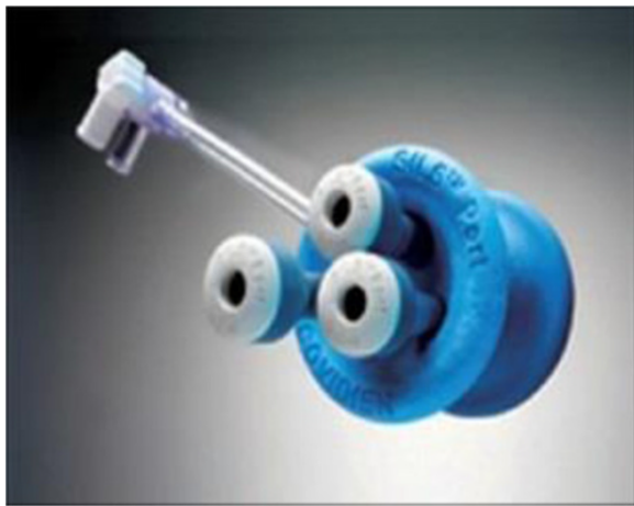
Figure 3 Covidien SILS™ port.