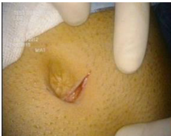
Figure 1 Umbilical incision.

Selective bilateral varicocelectomy was performed in 5 cases. Gonadal vein is identified and adjacent tissue with lymphatics is swept away, and the vein is ligated using titanium clips. The papaverine test is used for identification and preservation of the testicular artery. En bloc ligation of the spermatic cord and surrounding tissue was performed in the remaining 9 cases using Hem-o-lok®.