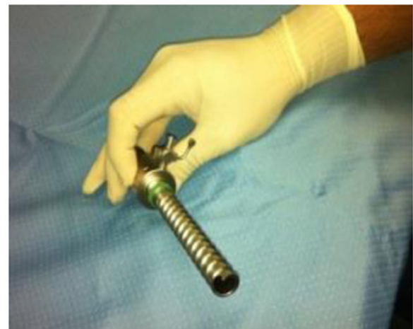
Figure 2 Ternamian EndoTIP 10 mm optical trocar.