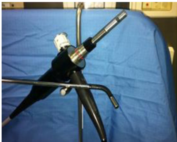
Figure 4 EndoEye camera system.

In conventional laparoscopy group operative time ranged from 65 to 130 minutes (mean: 88.3 minutes), and the estimated blood loss was insignificant. The hospital stay ranged from 24 to 168 hours (mean: 51.4 hours). Time to return to work ranged from 4 to 7 days (mean: 4.7 days). Five patients required postoperative analgesia.