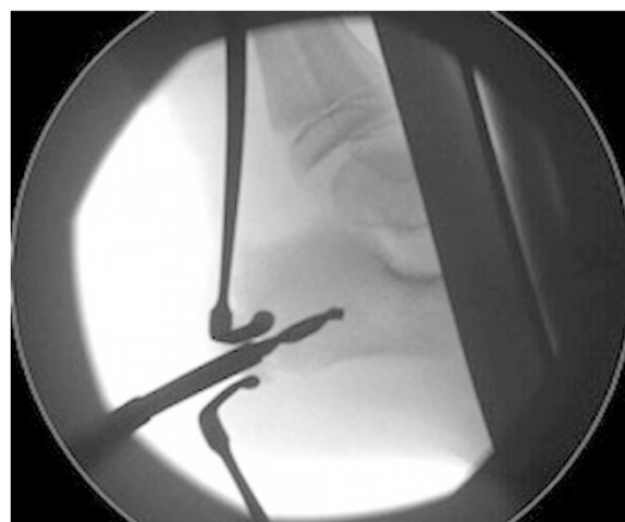
Fig. 6 Image intensifier used to guide drilling of os calcis in theatre

Cases of calcaneal osteomyelitis in the pediatric population often exhibit an indolent course, with presentations less dramatic than that of long bone osteomyelitis. Delays in diagnosis and initiation of treatment are common. One study of 60 cases of calcaneal osteomyelitis by Leigh et al. [1] reported an average of 6.8 days before medical advice