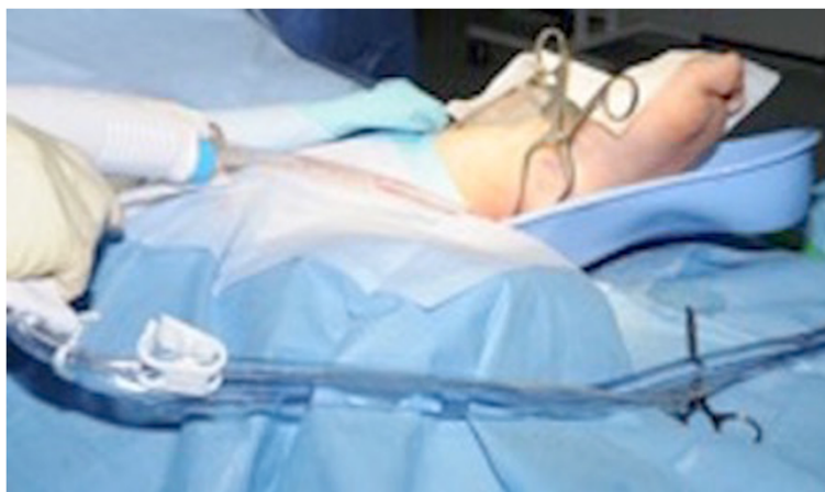
Fig. 7 Third look wound washout with normal saline

was sought, and a further 2.9 days until a diagnosis was established. Several other studies quote similar delays [2–6]. In our case there was a 10-day delay between presentation and diagnosis, with more definitive signs and symptoms developing later in the course. The diagnosis of calcaneal osteomyelitis should have been considered in this young patient presenting with heel pain at an earlier stage. Further imaging in the form of an MRI or bone scan when this patient initially presented would have clinched the diagnosis.