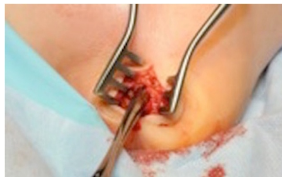
Fig. 5 Transverse incision above os calcis to drain pus

confirmed to be a Pantone-Valentine leucocidin (PVL)-negative strain. The patient continued his intravenously administered antibiotic regimen for a total of 2 weeks from the time of surgery, after which he was discharged home to continue with a 4-week course of flucloxacillin and fusidic acid administered orally. The blood results on discharge (3 weeks after admission) revealed a WCC of 5.4 \times 10^9/L , neutrophils 1.7 \times 10^9/L , ESR 18mm/hour and CRP <5\text{mg/L} .