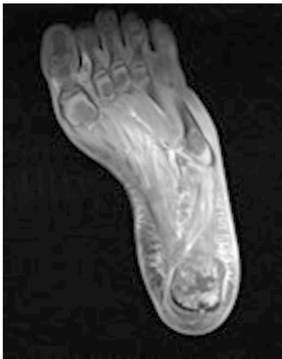
Fig. 4 Axial magnetic resonance imaging scan of the left foot with osteomyelitis of the calcaneum

Staphylococcus aureus was found to be responsible for the infection and, although community-acquired, it was