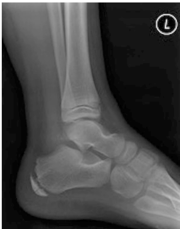
Fig. 1 Soft tissue swelling and tenderness is noted to the calcaneum. Modified technique has been applied. The calcaneal apophysis appears sclerosed and fragmented, but this can be a normal appearance in the developing calcaneum. There is suggestion of some widening of the talocalcaneal joint medially which may correlate with appearances noted at the subtalar joints on the ankle projections