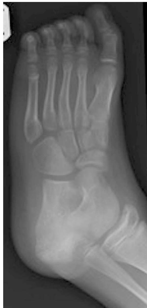
Fig. 2 Difficult examination due to patient distress. The foot and ankle has been held in a moderate degree of plantar flexion and internal rotation. Soft tissue swelling and posterior effusion is noted. Allowing even for the immature skeleton and positioning there appears to be significant widening of the subtalar joints and as this is the specific area of tenderness, bruising, inflammation, and some subtalar subluxation is suspected

Blood results revealed a white cell count (WCC) of 11.1 \times 10^9/L , neutrophils 8.0 \times 10^9/L , erythrocyte sedimentation rate (ESR) 68mm/hour and C-reactive protein (CRP) 198mg/L. An orthopedic opinion was requested, and he was promptly admitted for suspected osteomyelitis. A magnetic resonance imaging (MRI) scan of his left foot was obtained and it revealed osteomyelitis of the calcaneus bone and infection in the surrounding soft tissue (Figs. 3 and 4).