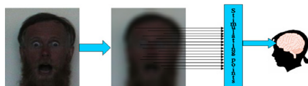
Figure 1 Schematic representation of the model.

The model learned to distinguish faces and objects accurately in a similar manner that an infant's brain builds the neural connections after birth. Preprocessing images used to remove high frequencies and random selection of stim-