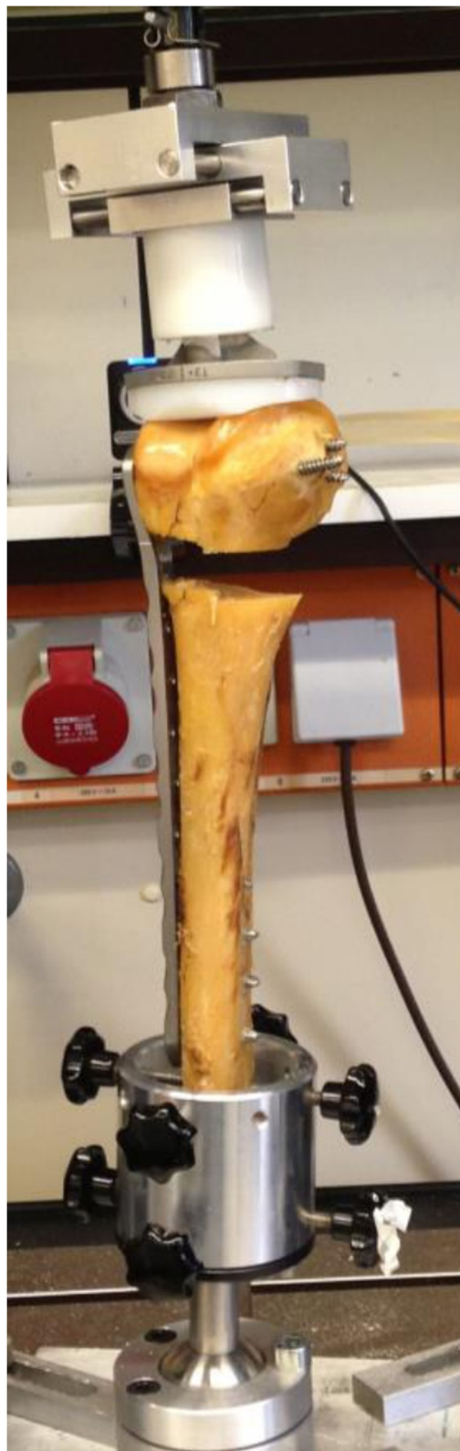
Figure 1 Biomechanical setting.

Statistical analysis was performed using the R program for statistical computing ( www.r-project.org ; version 2.15.0; package MethComp). Due to a low sample number