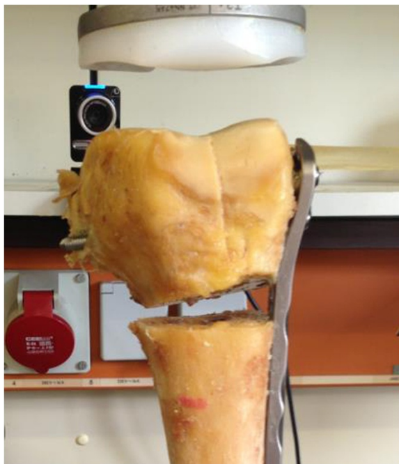
Figure 2 Failure at 1600 N (NCB-plate, sample 11/10) with deformation of the bone due to a cutout of the screws.

From a clinical point of view, there are two main targets: first, that the fracture heals, and second, that the construct itself does not fail [8]. Stress tests have indicated that the locking plates of the first generation may provide improved distal fixation of distal femur fractures especially in osteoporotic bone, withstanding greater axial loads and requiring higher energy to failure, compared to the angled blade plates or intramedullary nails [23,24]. In far distal fractures sufficient fixation of an intramedullary nail can be impossible, why in such cases