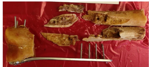
Figure 3 Complete pull out of the proximal plate and fracture at 2000 N at an osteoporotic bone. PERILOC®-plate (sample 17-10).