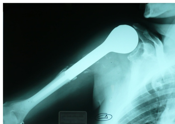
Figure 2 Right humerus nail replacement.

three times per week, recombinant human interleukin-2 at a dose of 9 \times 10^6 IU subcutaneously for 4 weeks followed by 1 week of rest, and vinorelbine 30 \text{ mg/m}^2 and zoledronic acid 4mg every 21 days. Then he underwent a right humerus nail replacement with 10-fraction radiotherapy in order to render his extremity pain-free and capable of weight-bearing (Figure 2). He was offered physiotherapy but declined. He received IFN- \alpha treatment for a further 4 months and, notably, resumed playing the bouzouki, which requires significant upper-extremity dexterity, attesting to a dramatic improvement of his symptoms. His disease was stable and he led an active life from September 2003 to June 2008, when a chest CT scan revealed several enlarged subcarinal, left hilar, and axillary lymph nodes. He was treated with sunitinib at 50mg/day for 4 weeks with a 2-week wash-out phase along with vinorelbine 30 \text{ mg/m}^2 , bevacizumab 200mg, and zoledronic acid every 21 days. A partial response was observed until February 2009, when a chest CT scan revealed several pulmonary nodes consistent