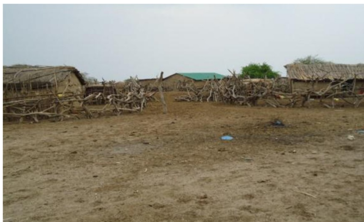
Figure 2 Representation of Maasai community village (Monic village, Ngorongoro district in Tanzania) on the Eastern arm of Rift Valley shared houses with domestic animals during the outbreak.

knew that there was a control measure currently in place that involved vaccination. The level of literacy in the study community was low due to nomadic lifestyle with 37.8% (28) being illiterate, 39.2% (29) standard seven, 5.4% (4) form four, and 1.4% (1) of the respondents being college graduates. This has an impact not only in the transmission and implementation of control strategies for RVF but also in the control of other livestock diseases.