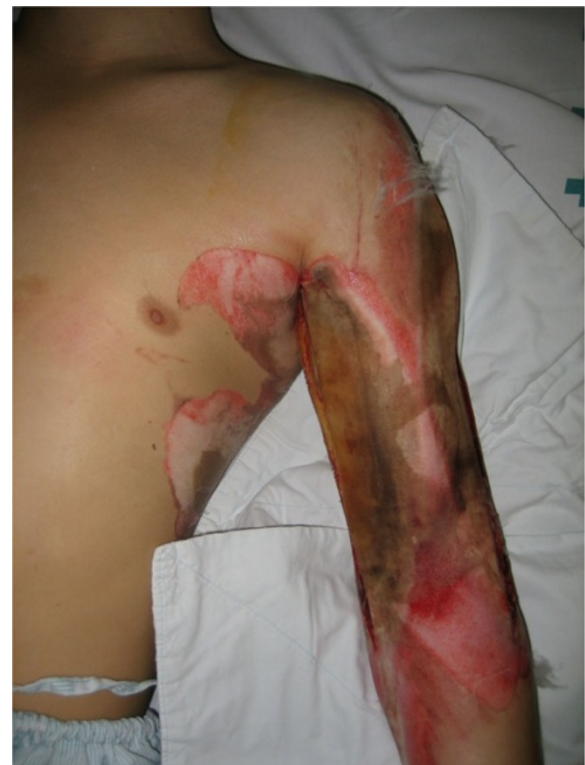
Figure 2 Clinical image at the time of the contact burn six months earlier. At the time of the contact burn six months earlier, the patient had undergone immediate fasciotomy for a wound at the medial and lateral aspect of the upper arm. The exposed neurovascular bundle was covered with a latissimus dorsi musculocutaneous flap, and the rest of the lesion was covered with a split-thickness skin graft.

The brachial artery pseudoaneurysm usually develops slowly. It took days to months, even years to develop symptoms or be detected clinically. A brachial artery pseudoaneurysm often presents with erythema and induration, together with an expanding, painful mass. It is sometimes accompanied by a thrill or an audible bruit, decreased temperature, cyanosis, loss of pulsation, and paresthesia upon nerve compression of the distal extremity [22]. Various diagnostic methods can be used, including arterial Doppler ultrasonography, angiography,