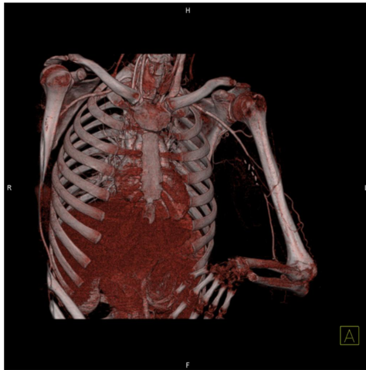
Figure 5 Ten days postoperative three-dimensionally reconstructed angio CT scan. Postoperative view of the three-dimensionally reconstructed angio CT scan 10 days after the removal of the pseudoaneurysm. Intact distal flows were noted.

Endovascular stent-grafts implantation is a minimally invasive intervention with a high success rate. However, the high cost of the device, luminal stenosis, and long-term complications, such as device failure, should be considered [28,29]. Embolization of the sac is indicated when the sac is small and the pseudoaneurysm does not disturb the distal circulation. Embolization of the distal and proximal arterial segments is only indicated if collateral circulation is sufficient [25]. US-guided compression was first introduced as a treatment of postangiographic femoral artery injury and also applied for treatment of a brachial artery pseudoaneurysm [30,31]. However, there are limitations, such as a long procedural time, patient discomfort, and lower effectiveness with an anticoagulated patient. When there is infection, coexisting large hematomas with impending compartment syndrome, limb ischemia, skin ischemia, excessive patient discomfort, and unsuitable anatomy, US-guided compression is contraindicated [26]. Percutaneous thrombin injection is performed under US-guide and also conducted with the aid of intraluminal balloon occlusion [32,33]. This has shown a high success rate and a low recurrence and complication rate. However, there have been several reports of complications, such as distal embolization, anaphylaxis, abscess formation, and pseudoaneurysm rupture. There can be complications including median nerve traction due to