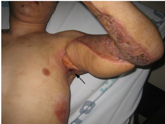
Figure 1 Initial presentation of the patient. A round ulcerated wound was noted at the posterior axilla.

USA) sutures. The brachial artery and accompanying median and musculocutaneous nerves showed fibrotic adhesion to the surrounding muscle and fascia. The tethering adhesions were carefully removed in order to recover neurovascular bundle gliding. The wound was closed with replacing the elevated flap after placing an Jackson-Pratt drain. After the removal of the pseudoaneurysm, the distal circulation was maintained. The patient received three packs of packed red blood cells postoperatively and the patient's vital signs were stabilized again. A CTA taken on postoperative day ten confirmed that the pseudoaneurysm had disappeared and that the distal circulation was being maintained (Figure 5). During one year of postoperative follow up, there was no recurrence of distal circulation impairment or pseudoaneurysms.