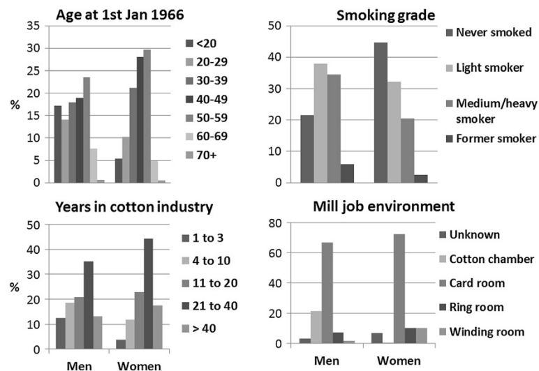
Figure 1 Worker demographics. Histograms that show the demographics of the men and women cotton workers.