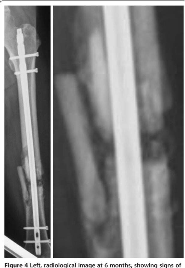
Teriparatide was started at this point. Right, magnification of the image above.

and alcohol abuse and had no history of metabolic disease or glucocorticoid intake. Other laboratory data, including serum alkaline phosphatase, intact PTH, and calcium, were normal (Table 1). However, he had high levels of bone quality marker, uncarboxylated osteocalcin ((ucOC), 18.8 ng/ml; reference value, <4.50 ng/ml) and serum homocysteine ((Hcys), 21.9 nmol/ml; reference value, 3.7 – 13.5 nmol/ml). Dual-energy X-ray absorptiometry assessment of bone density showed almost normal: 0.891 \text{ g/cm}^2 and T-score of -0.2 standard deviation on his radius. In other words, this patient had mildly compromised bone quality [5-8]. Callus formation in the fracture area remained poor 3 months after the first surgery, but the patient could not take any more time away from his company. Therefore, when he left the hospital he used crutches to assist with partial weight bearing ambulation. Both LIPUS and vitamin K2 preparation administrations were initiated at this time with the aim of lowering his high ucOC level. Callus formation in the fracture area was still insufficient at 3 months following initiation of LIPUS. Therefore, teriparatide was started in combination with LIPUS (Figure 4). Callus formation was good when assessed at 3 months after the start of teriparatide intervention (Figure 5). Bony union was good and full weight