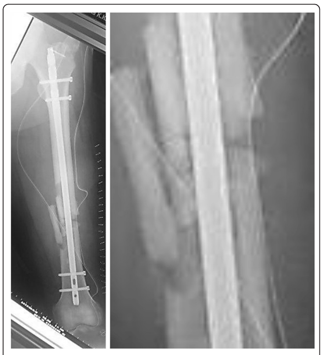
Figure 2 Left, postoperative radiologic image of the femoral diaphyseal fracture (OTA 1, 32-C1.3) treated using interlocked intramedullary nailing. Right, magnification of the image above.