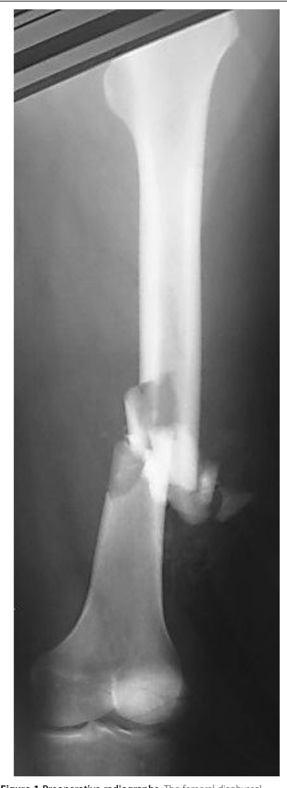
Figure 1 Preoperative radiographs. The femoral diaphyseal fracture (OTA 1, 32-C1.3).