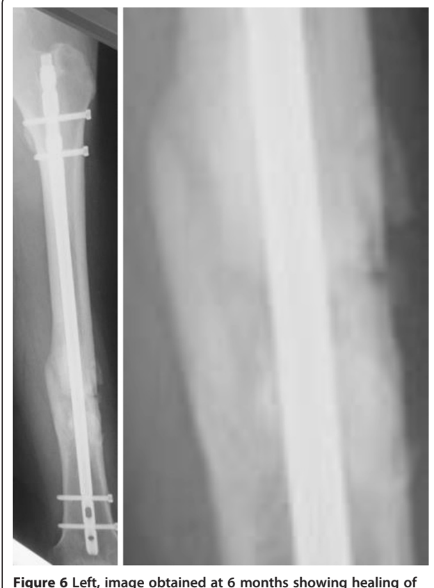
Figure 6 Left, image obtained at 6 months showing healing of the nonunion. Right, magnification of the image above.

group [9]. Warden et al. [4] reported that teriparatide and LIPUS have contrasting additive, rather than synergistic, effects during fracture healing. Teriparatide primarily increased callus bone mineral content (BMC) without influencing its size, whereas LIPUS increased callus size without influencing BMC in rat studies. Fracture healing is a complex biologic process and is impacted by multiple factors [10]. Watanabe et al. [11] reported that LIPUS is a relatively new technique for the acceleration of fracture healing in nonunion situations. It has a frequency of 1.5 MHz, a signal burst width of 200 microseconds, a signal repetition frequency of 1 kHz, and an intensity of 30 mW/cm<sup>2</sup>. The beneficial effect of fracture healing acceleration with LIPUS is considered to be larger in patients with potentially negative factors for fracture healing. LIPUS is a pain-free therapy performed daily at home by the patient with the possibility of avoiding further surgical procedures. This outpatient treatment reduces the length of hospital stays and reduces overall system wide health care expenses. The incidence of delayed union and nonunion is 5% to 10% of all fractures. While LIPUS has beneficial effects on collagen enzymatic cross-link formation, mechanical stress may improve bone quality. Nonunion