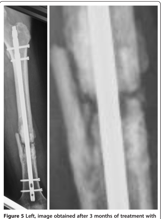
Figure 5 Left, image obtained after 3 months of treatment with teriparatide. Bone bridging and a decrease in interfragment gaps are observed. Right, magnification of the image above.

group [9]. Warden et al. [4] reported that teriparatide and LIPUS have contrasting additive, rather than synergistic, effects during fracture healing. Teriparatide primarily increased callus bone mineral content (BMC) without influencing its size, whereas LIPUS increased callus size without influencing BMC in rat studies. Fracture healing is a complex biologic process and is impacted by multiple factors [10]. Watanabe et al. [11] reported that LIPUS is a relatively new technique for the acceleration of fracture healing in nonunion situations. It has a frequency of 1.5 MHz, a signal burst width of 200 microseconds, a signal repetition frequency of 1 kHz, and an intensity of 30 mW/cm<sup>2</sup>. The beneficial effect of fracture healing acceleration with LIPUS is considered to be larger in patients with potentially negative factors for fracture healing. LIPUS is a pain-free therapy performed daily at home by the patient with the possibility of avoiding further surgical procedures. This outpatient treatment reduces the length of hospital stays and reduces overall system wide health care expenses. The incidence of delayed union and nonunion is 5% to 10% of all fractures. While LIPUS has beneficial effects on collagen enzymatic cross-link formation, mechanical stress may improve bone quality. Nonunion