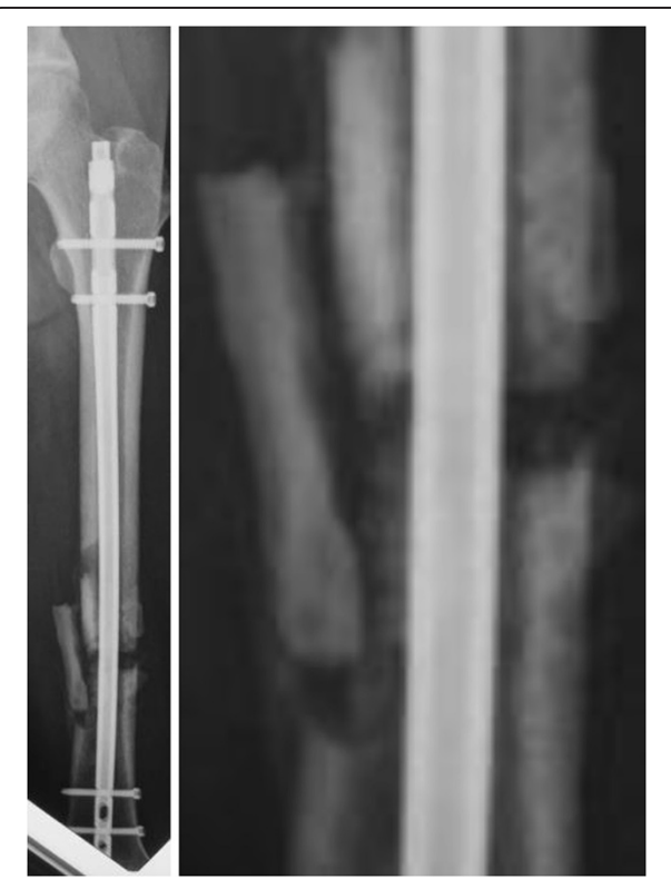
Figure 3 Left, radiologic image at 3 months, showing no signs of healing but also no displacement. LIPUS was started at this point. Right, magnification of the image above.