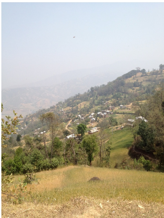
Figure 3 Households in a selected Hill district.

Three of the five Mountain districts were inaccessible by land. Even after flying to the nearest airports, two of these would require long uphill walks (Figure 6) to reach