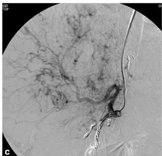
Figure 3 A case of a 58-year-old woman with hepatocellular carcinoma. The branching angle of the origin of the celiac artery was 168 degrees in the multiple projection volume reconstruction image of the sagittal maximum intensity projection (a). Digital subtraction angiography showed sharp downward branching of the celiac artery (b). The subclavian arterial route was selected for implantation of an intra-arterial hepatic port system (c).

artery, may be one reason. Lindner and Kemprud reported that the celiac artery branched right below the median arcuate ligament in 25 of 75 autopsy cases (33%). The rate of downward direction of the celiac artery may be high due to compression by this ligament [7,8]. In addition, breathing affects the angle of celiac artery. CT scans were obtained during deep inspiration, and, thus, the angle of the celiac artery may be exaggerated. However, there have been no reports in the English literature about the branching angle of the celiac artery.