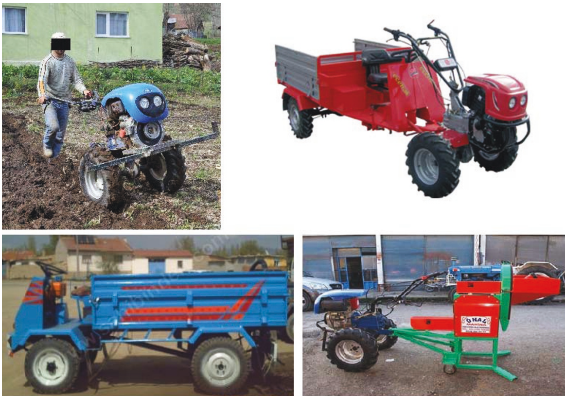
Figure 1 Images of Pat-Pat and equipments.

In this study, for statistical analysis, "SPSS for Windows 11.5" software package was used. In the analysis of