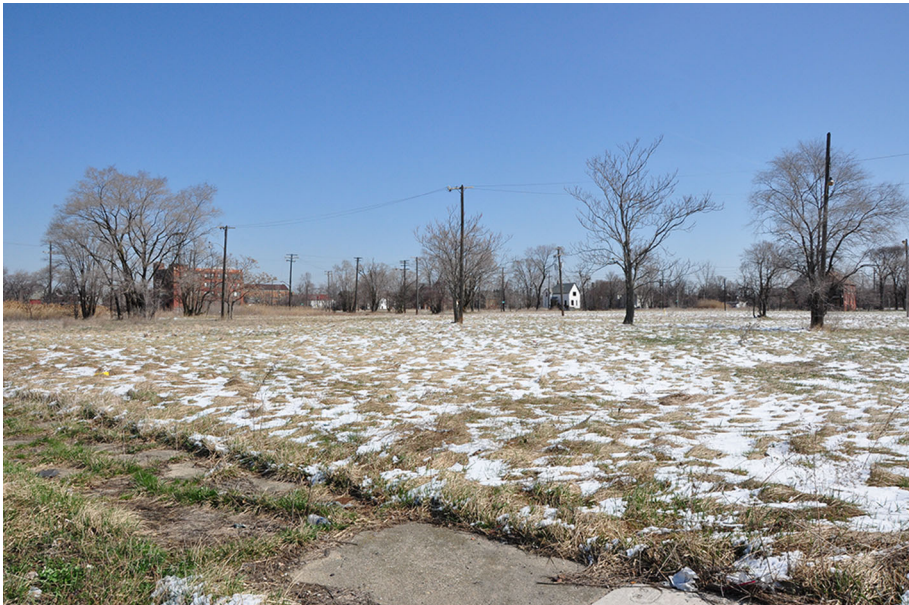
Fig. 7 Outside of the revitalized areas we discussed, much of Detroit looks like this. This is the near East Side of Detroit, less than five minutes drive from Midtown

Detroit is being looked at with closer scrutiny than almost any other city. Therefore what happens here will not only shape the Motor City, but potentially hundreds of other cities across America and beyond. Detroit's downtown renaissance is becoming a major point of celebration, both in the media and among some academic circles (Ager 2015; Austin 2014; Coyle 2014; Florida 2013, PPS). That is why critical urban scholarship is needed to illustrate the social and spatial consequences of the impact of what happens in Downtown Detroit beyond its borders. Far from being unique, we see Detroit as representative of fragmented, neoliberal urbanism, where a combination of residents with economic and social capital, businesses and institutions all help to produce functioning and prosperous urban islands among a sea of increased poverty, despair and political, civic and institutional neglect (see Fig. 7). In this vein, we reiterate the recent words of Akers and Leary (2014) as they comment on Dan Gilbert's transformation of downtown: "Detroit's atomization is inexplicably reframed as a commentary on its revitalization. And while many city residents in the (gentrifying) downtown area surely benefit from Gilbert's infrastructure investments, can anyone plausibly argue that this is a solution for the city as