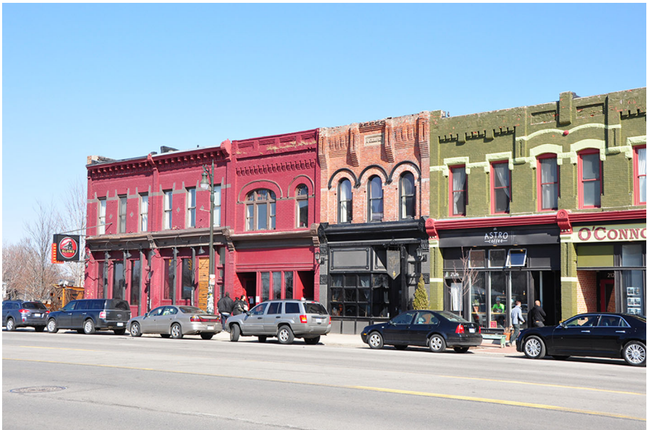
Fig. 6 Slows BBQ ( left ) on Michigan Avenue in Corktown