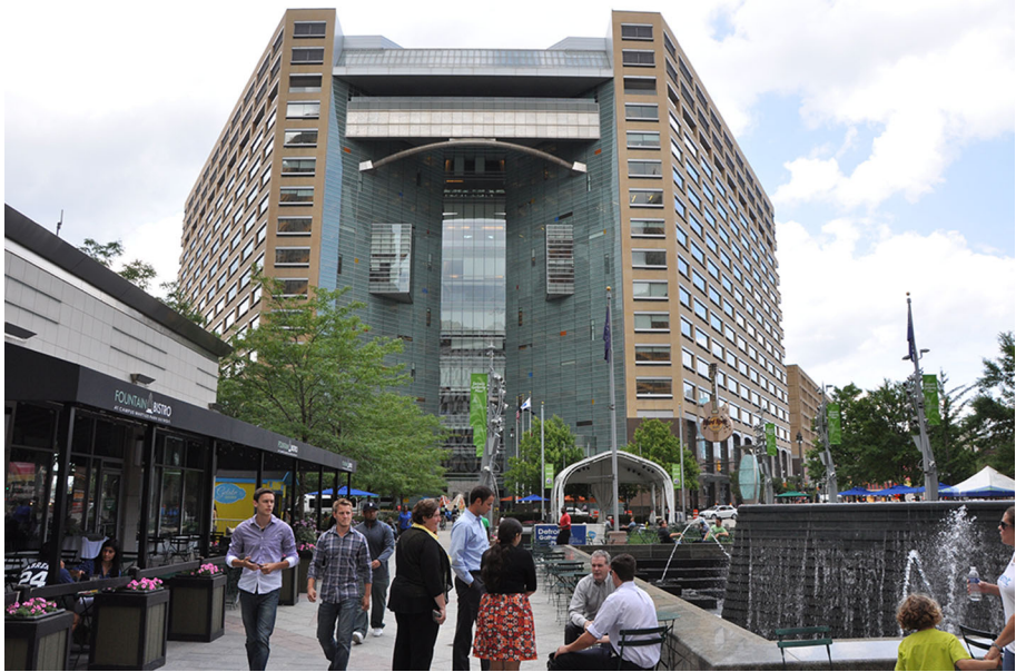
Fig. 3 Campus Martius with the Compuware world headquarters. The building is also home to Quicken Loans

block-wide hole where the Hudson's department store once stood. But the place feels more sterile than threatening. (Segal 2013)