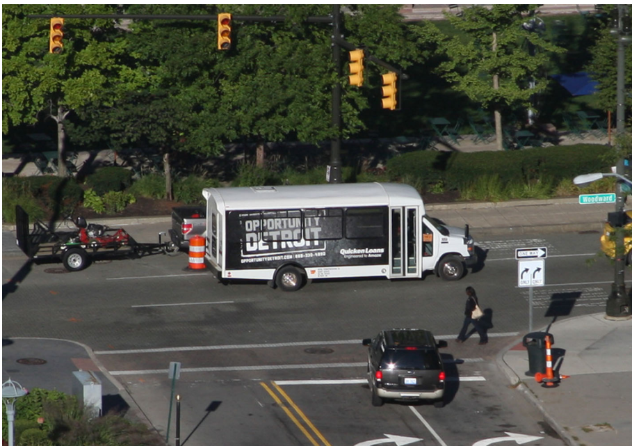
Fig. 2 An 'Opportunity Detroit' shuttle bus running Downtown

While Downtown has been the focal point of urban growth strategies for decades, today's changes are largely being driven by Dan Gilbert (Akers and Leary 2014; Austin 2014; Segal 2013). The billionaire founder of Quicken Loans and a native of the Detroit-area has bought more than forty buildings Downtown, through his property arm, Rock Ventures. Opportunity Detroit, whose banners and posters can be seen all over Downtown, is part of the marketing and promotional wing of Gilbert's growing Downtown property empire. They provide one of the amenities greatly lacking to the new Downtown