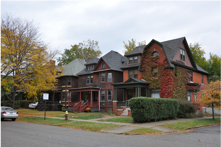
Fig. 4 Avery Street in gentrifying Woodbridge

lot of crime and fires.’ Today this has radically changed, as another of our respondents noted: ‘now there are kids on bikes without parents. You would not see that in many other neighborhoods in Detroit.’