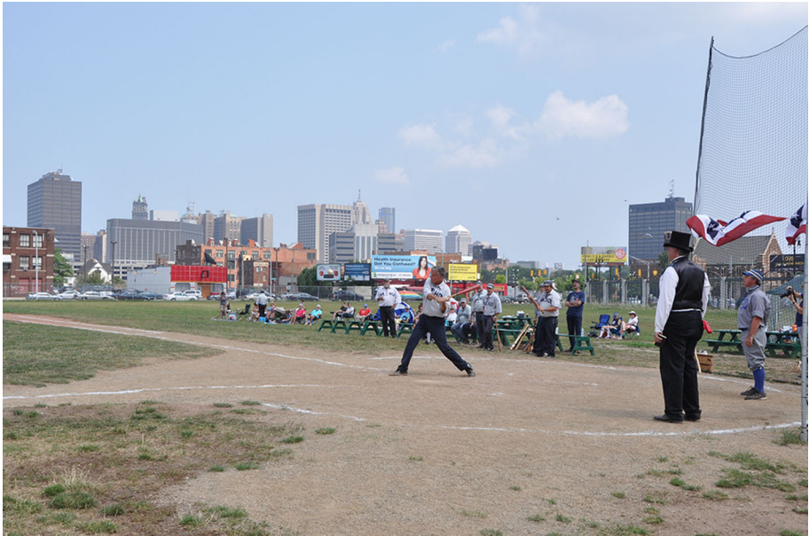
Fig. 5 The old Tiger Stadium in Corktown, which, thanks to the Navin Field Grounds Crew, has been reimaged as a park