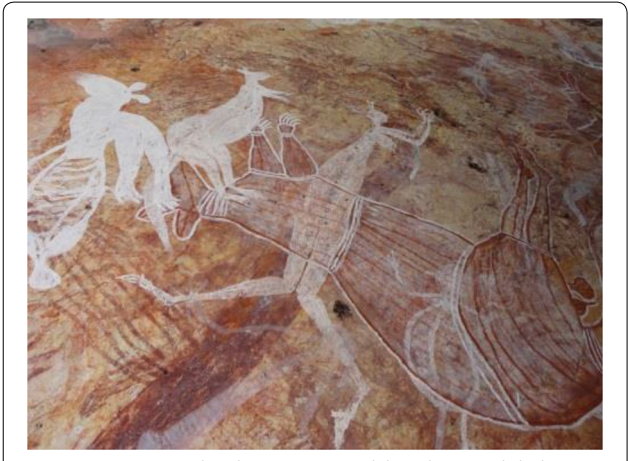
Fig. 1 Superimposed rock art images, Dalakngalarr 1 rockshelter in Arhnem Land, Northern Territory.