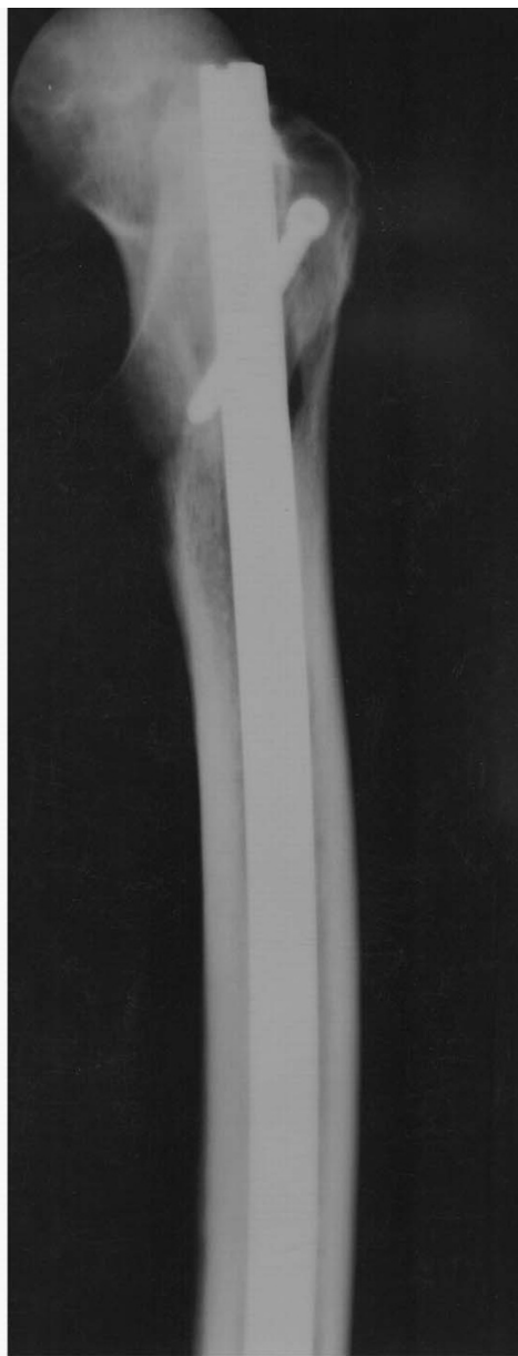
Figure 5 Lateral radiograph of the same femur. No evidence of fracture line can be documented.

copy is the preferable means of monitoring IMN intraoperatively. However, C-arm images often do not reveal subtle fractures that plain radiographs might, as the quality of the images using C-arm fluoroscopy is usually worse than that of plain radiographs [10].