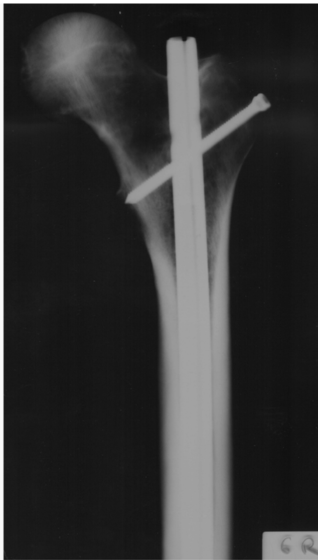
Figure 4 Anteroposterior radiograph of the same femur. No evidence of fracture line can be documented.

The placement of the nail more anteriorly to the posterior third of the neck in this study was complicated with a prevalence of 56% of anterior femoral splitting. All of these lesions were seen during nail insertion, at its final phase. A possible explanation could be that during reaming the flexible shaft of the reamers could easily follow the curved path of the medullary canal, as the femur is convex anteriorly. On the other hand, during nail insertion the relevant stiffness of the nail, the mismatch in curvature between the inserted nail and the medullary canal, in combination with an entry point anterior to the trochanteric fossa has possibly led to the femoral splitting. As described in an article by Egol et al [9], the average femoral anterior radius of curvature is 120 cm (SD \pm 36) and there is a significant mismatch between the anatomical radius of curvature of the femur and most intramedullary