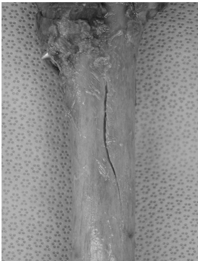
Figure 3 Close-up photo of the splitting in the same femur.

in consistent cracking of the proximal femur. Alho et al [8] also reported a 26% prevalence of proximal fragment comminution with an anterior insertion of the intramedullary nail. However, none of these studies used radiographic control to investigate the diagnosis of such lesions.