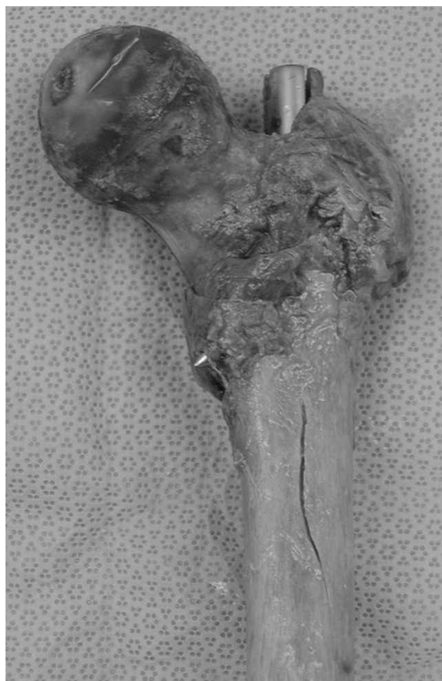
Figure 2 It is evident the longitudinal splitting in the anterior cortex of a femur.

No other fractures were found during inspection or radiographic control either in the first or in the second group. The radiographic and fluoroscopic control in the five frac-