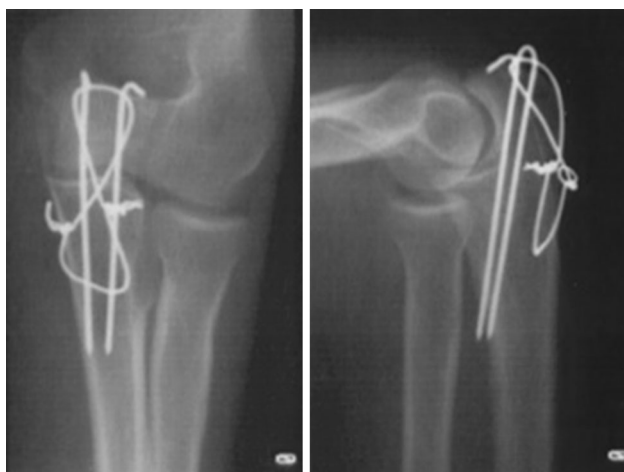
Fig. 2 Antero–posterior and lateral radiograph of a simple olecranon fracture. It can be conflicting if the Kirschner wires were oversized in term of length and if twisted ends of the wire knot were sufficiently bent back into direct contact with the bone

have not been associated with worse clinical outcome in clinical series to date.