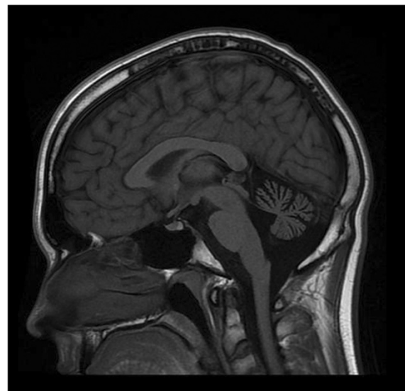
Figure 2 MRI of the brain. MRI was performed on Patient 1 at 12 years of age. T1W1 sagittal image demonstrates prominent cerebellar atrophy involving superior and middle cerebellar folia. Axial images (not shown) revealed normal subcortical and cerebellar white matter. MR spectroscopy was normal (not shown). Repeat MRI imaging at 16 years old was unchanged (not shown). MRI of the brain (Patient 2) showed a similar pattern but milder cerebellar atrophy (not shown).

significant for very mild pes cavus and hyporeflexia (biceps 1+, brachioradialis 1+, triceps 2+, patella 1+, ankle jerk 0), flexor plantar responses and mild anterior compartment weakness (tibialis anterior 4+/5, peroneus longus 4+, extensor hallucis longus 4). Sensory testing was normal except for pin-prick hyperesthesia to his toes. Mild ankle tightness was noted. Coordination was normal. Nerve conduction studies (Table 1) revealed a mild sensorimotor polyneuropathy with demyelinating features. Fundoscopic examination revealed widespread