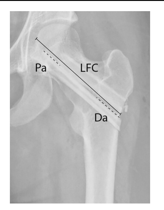
Fig. 2 Assessment of the anchoring ratio of the graft in vital bone. The proximal anchoring (Pa) and distal anchoring (Da) parts of the graft were measured and divided by the length of the femoral collum (LFC) to obtain the ratio. In case two grafts were used, we chose the measurement with the deepest anchoring. LFC was defined by as the length between the lateral cortex and femoral head in alignment with the graft.

Resorption of the graft was determined by evaluation of consecutive, yearly radiographs undertaken by one of the authors (BCJM). Grafts were scored as "totally resorbed" if over 50% of the graft was resorbed or if resorption extended to the full diameter of the graft.