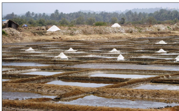
Figure 2 Salt production at Siridao located in Tiswadi taluka of Goa. Precipitated salt is heaped and kept for drying at the corners of the crystallizer pans.

from the states of Gujarat, Rajasthan and Tamil Nadu, which is about 90% of the country's total production [16]. Salt production methods vary widely among the different salt producing states. Apart from sea water, sub-soil brine, lake brine and rock salt deposits are also being used for salt production [17]. Private sector plays a major role in salt production, contributing 90.3%. Most of the salt pans have iodisation plants located nearby for fortifying the salt with iodine and iron. Looking at the scenario of other Indian salt producing states, Goa's salt production fails to meet its local demand.