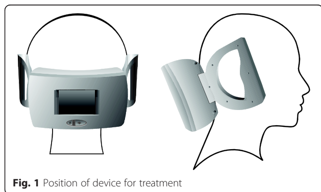
Fig. 1 Position of device for treatment

A total of 449 patients were prescribed sTMS of which 331 completed initial training and first survey at 6 weeks. One hundred and ninety (42 %) used the device to treat