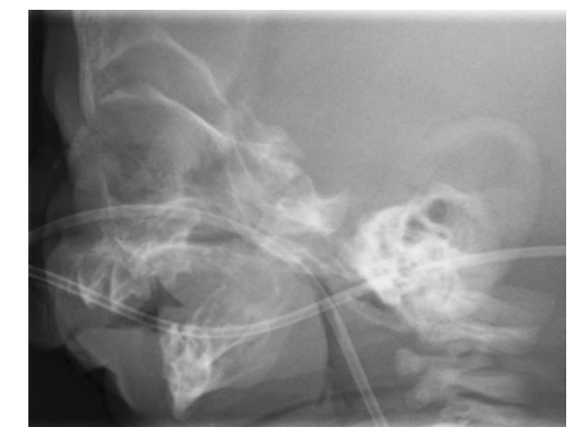
Fig. 4 Example of micrognathia seen on lateral X-ray

use NPA in every infant with significant UAO before a surgical measure is initiated, and no longer apply a mayotube or CPAP. Yet, the exact place of CPAP still needs to be defined in the treatment of RS. Certain drawbacks of NPA are known. Duration of treatment, obstruction, or luxation of the tube, the burden of care for the parents when the child is discharged with NPA, and persistent feeding problems during the treatment have been described [10, 60]. Finally, also other conservative options, such as the custom-made palatal plate or preepiglottic baton plate (PEBP), have been described to date [12,