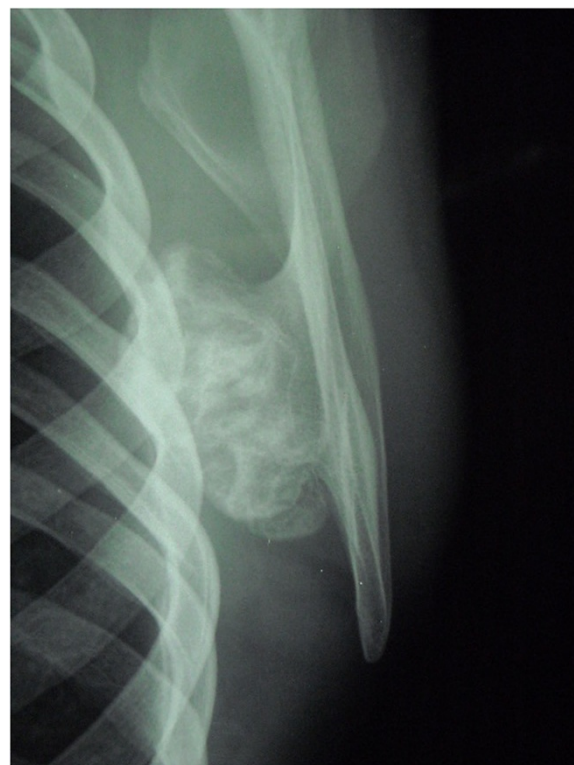
Figure 2 Radiographic study showed a large bony lesion deforming the medial border of the left scapula.