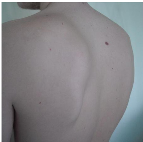
Figure 1 Clinical examination of the shoulder showed an evident winging of the left scapula.