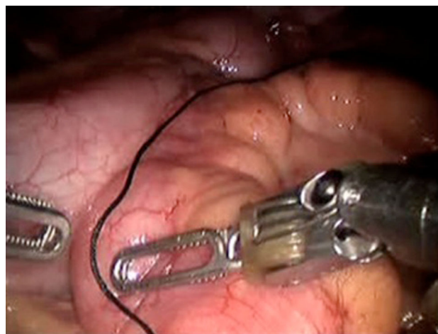
Fig. 1 Identification and measurement of ileum

The da Vinci Surgical System robot (Intuitive Surgical, Sunnyvale, CA, USA) was used for the entire procedure and a video example of the entire surgical procedure for one of the patients included is available online at http://www.youtube.com/watch?v=QLBzoUEWVIg . The patients were placed in dorsal lithotomy position in steep Trendelenburg for the operation. Three robotic ports and two assistant ports were used in positions similar to that of a robotic-assisted laparoscopic prostatectomy. A 3-0 silk holding suture was placed in the ileum 15 cm proximal to the ileocecal valve and a separate 3-0 silk suture was placed 15 cm proximal to the first suture (Figs. 1, 2). A surgical stapler was then used to isolate a 15-cm loop of ileum and perform a functional end-to-end anastomosis. Next, a U-shaped bladder flap was created using electrocautery. Then, after spatulation of the antimesenteric side, the proximal end of the ileal loop was sutured to the bladder (Fig. 3). The bladder was irrigated to ensure no leakage. A suture was then placed on the distal end of the ileal loop and brought through one of the ports or