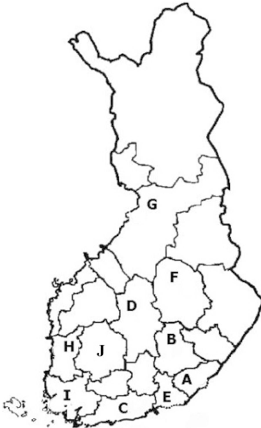
Figure 1 Participated Finnish hospital districts

The data was analyzed using IBM SPSS Statistics 22.0 (IBM, USA 2015). The independence of two categorical variables was tested for with \chi^2 test. Mean values of