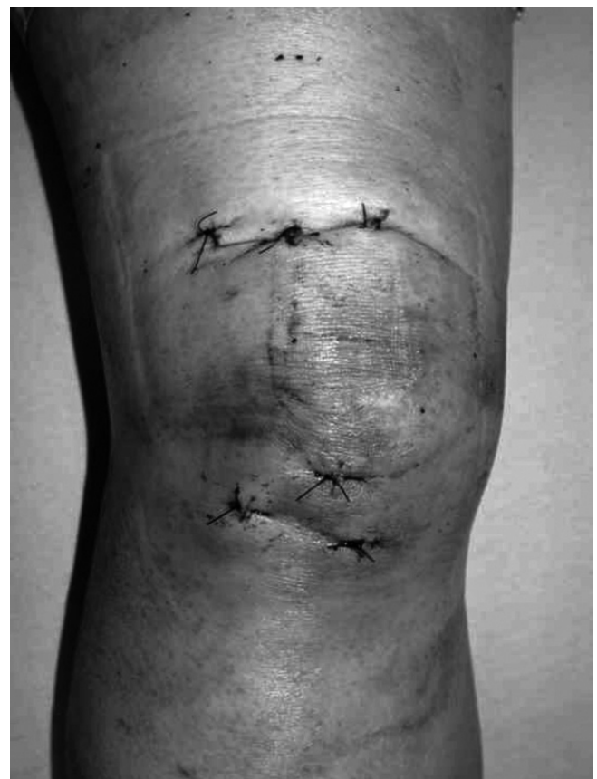
Fig. 3. Local soft tissue condition at a week after surgery in the percutaneous osteosynthesis with modified Carpenter's technique.

OMATB = open modified anterior tension band technique; POMC = percutaneous osteosynthesis with modified Carpenter's technique.