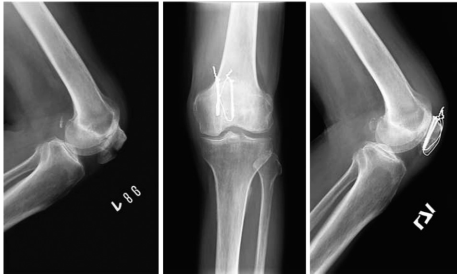
Fig. 2. Preoperative and postoperative 9-week radiographs of one case in the group of percutaneous osteosynthesis with modified Carpenter's technique.

concluded it was impossible to apply the figure-eight wire percutaneously. Yanmis described circular external fixator under arthroscopic control for comminuted patellar fractures. 12 All these articles proved minimally invasive approach could be achieved for transverse patellar fractures. However, the strength of fixation was still a concern.