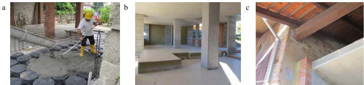
Fig. 2. (a) casting of the floor slab above disposable formworks; (b) structure of the house with insulation layers; (c) roof details.

Windows are composed by aluminum frame with thermal break with low-e triple-pane glass with argon ( U_{\text{window}} = 0.96 \text{ W/m}^2\text{K} ). Thermal bridges are eliminated through a careful study of anchoring and joints between external insulation layer and window wooden sub-frames.