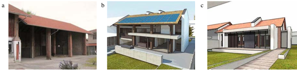
Fig. 1. (a) The preexisting rural building, south front; (b) the first design concept; the current architectural design.