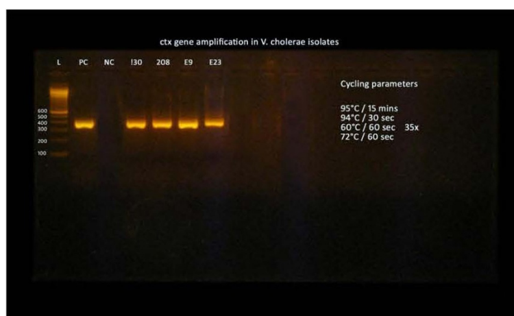
Figure 2 Amplification of ctx gene in V. cholerae isolates (L-Ladder, PC-Positive control, NC-Negative control, clinical V. cholerae isolate; 130, 208 and environmental isolates; E9 E23 showing positive ctx band).

sensitivity of 90% and 77.3% to cefotaxime and chloramphenicol respectively. However they showed that 81.8% of strains were resistant to tetracycline. Garg et al. , reported high-level resistance to chloramphenicol in India. This result contrasted to our findings [13]. Macrolide resistance was rarely reported in the studies by Harris et al. , 2012 and Kanskar et al. , 2011 [2,22], yet a high level erythromycin resistance (90.9%) was found in our study. Resistance to erythromycin and other antimicrobial agents among V. cholerae can be acquired through selected mutations over the time, or due to widespread use of antibiotics for prophylaxis in asymptomatic individuals [38].