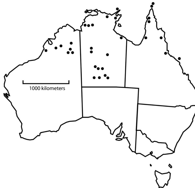
Figure 2 The 32 RhFFUS sites from Western Australia, the Northern Territory, and far north Queensland.

outlined below. Given the uncertainty of interpretation of minor echocardiographic abnormalities, criteria for cases are more sensitive than WHF criteria for borderline RHD [23]; 47 of the 137 cases included in RhFFUS satisfy the criteria for borderline RHD. Controls will be children who had a normal echocardiogram as outlined below.