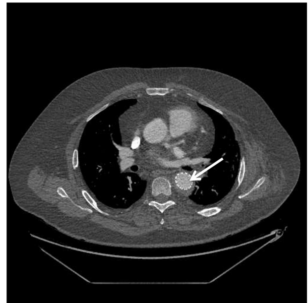
Fig. 3. CT image of the chest showing thoracic endovascular aneurysm repair successfully excluding the aortobronchial fistula. (White arrow – endovascular stent graft).

thoracic aorta aneurysm or pseudoaneurysm, which causes of an erosion of the lung parenchyma or tracheobronchial tree; this allows blood to travel from the aorta into the lung, manifesting as frank hemoptysis. The aneurysm can have numerous etiologies including tuberculosis, syphilis, fungal infections, trauma and atherosclerosis, mainly seen in elderly patients [6]. In younger patients, ABF is more frequently can be secondary to surgical repair of congenital heart defects, and aortic coarctation repair [1,6]). Several factors can lead to fistula. In the cases where surgical intervention involves the implantation of prosthesis, as is the case in aortic coarctation correction, the aneurysm or pseudoaneurysm can form in the proximal or distal suture lines of the prosthesis. Once formed, the continuous pressure of blood against the weakened vascular wall leads to damage of the aorta and subsequent lung parenchyma - usually of the left lung - resulting in the formation of a communication between the two structures. Furthermore, the foreign