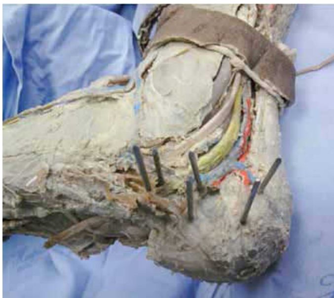
Figure 2 – Photograph of the heel of a cadaver with Kirschner wires coming out of the medial face.

2 and 5 mm, i.e. these were considered to present a moderate risk of injury. Wires located at distances of between 5 and 10 mm were classified as risk grade 1, i.e. they were considered to present minimal risk of injury. Kirschner wires located at distances greater than 10 mm were not considered to present any risk of injury and were classified as risk grade 0 (Table 1).