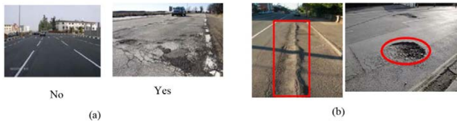
Fig. 3. (a) Results of a “presence” method. (b) Results of a “detection” method.

produced are further processed for defect detection whereas the digital images assist in the post-verification of the final outcome.