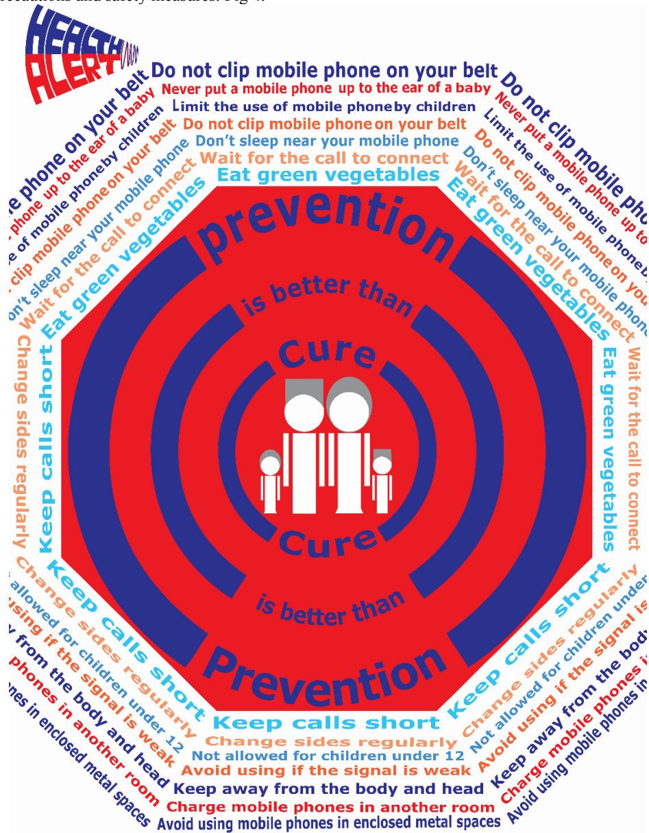
Fig. 4: Poster Design

To be able to unit people through graphic images, a visual symbol that is so universally understood by people from around the world was added to the Poster design; the traffic sign of “STOP and give way”, an octagonal red sign which used to give order in addition to the illustration of a family surrounded by RF. The poster design is also including precautions and safety measures. Fig 4.