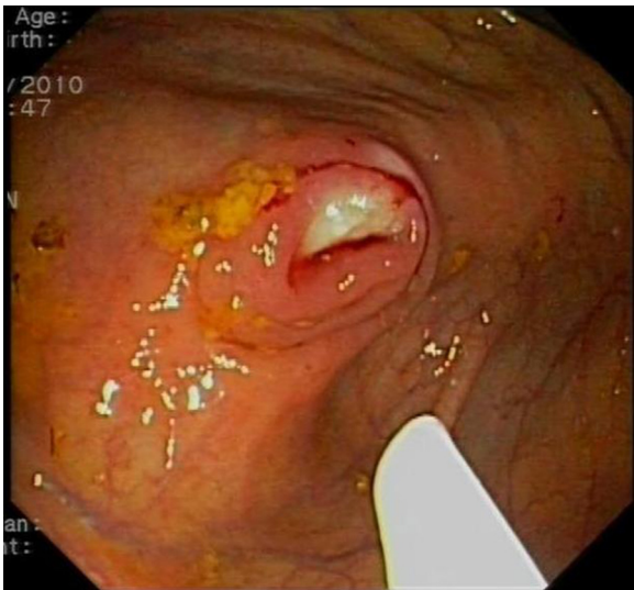
Figure 2 Appendicular orifice after resection of the polyp.