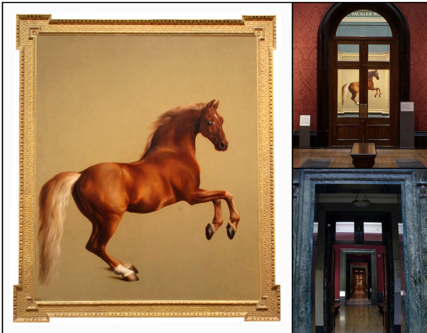
Figure 1. A Well-Hung Horse

(Left) Whistlejacket by George Stubbs, 1762. Oil on canvas. 9.5 × 8 ft. The painting hangs in London's National Gallery at one end of the museum's long main corridor and can be seen through ten intervening rooms that connect one end of the museum to the other. (Upper-right) Whistlejacket is seen through the door in Room 35 that leads directly to Room 34, where Whistlejacket hangs. (Lower-right) Whistlejacket is seen through the door in Room 9, which is located at the opposite end of the museum's long corridor from Room 34. http://nationalgallery.org.uk/visiting/virtualltour/ .