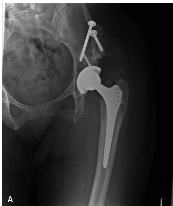
Figure 2a. Anteroposterior radiograph of a 35 year old female five years status post MOM total hip replacement for acetabular dysplasia and severe secondary osteoarthritis. She was initially pain free but now has diffuse left hip pain.