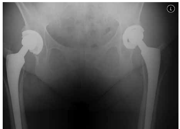
FIGURE 1. BILATERAL TOTAL HIP REPLACEMENT

Figure 1. Twenty year followup pelvis radiograph in a 65 year old female with bilateral total hip replacements for moderate acetabular dysplasia and osteoarthritis. Her functional status bilaterally is excellent though the radiographs demonstrate moderate linear wear of her conventional polyethylene liners.