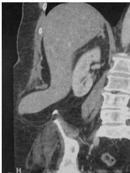
Figure 1 Abdominal CT scan (coronal section) showing herniation of the right lobe of the liver.