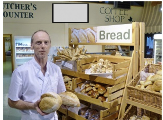
Fig. 6. Producer, Farm Shop 2.

Based on the premise that AFNs revolve around social relations, the importance of offline social relationships in sharing interests or behaviour was apparent. For example, around half of respondents (50%) heard about the respective AFNs through 'word of mouth', with the remaining made aware through advertisement of an event or from a poster. SFC respondents were also made aware of the business from 'passing by' (32%) the Farm Shop or online (18%). Social relations are shown through images