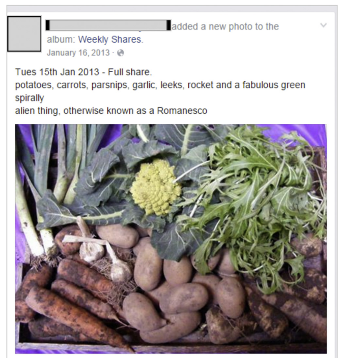
Fig. 4. Vegetable share contents on Facebook, CSA 1.

Images of food were present across all of the case studies, including the types of produce grown or produced and available in CSA shares (Fig. 4). In particular, images of the weekly share of produce (accompanying the lists of produce – see Fig. 5), as well as produce being planted and harvested were common and something that members reported appreciating. This allows members to extend the experience of connecting to the land, produce and the scheme, through a virtual capacity.