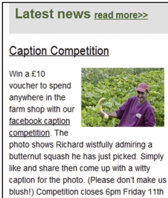
Fig. 3. Website competition (linking to Facebook), Farm Shop 2.

One Farm Shop kept their website up to date by integrating it to their Facebook page through regular competitions and promotions, encouraging online consumer interaction, and maximising the promotion/exposure of the AFN across multiple online platforms (Fig. 3).