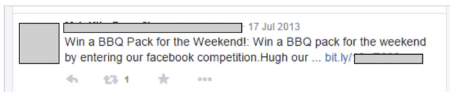
Fig. 1. Twitter competition (linking to Facebook), Farm Shop 2.

An analysis of Twitter activity (Table 2) shows that the number of tweets varies from 59 to 431 across the AFNs; there is also a range of followers of AFNs' Twitter accounts (58–332). However, whilst some AFNs are following between 27 and 467 other Twitter profiles, two of the AFNs are not following many people at all (0 and 8). This shows that, in line with social media use as a business tool for promotion, the two Farm Shops use Twitter for more of a one-way promotional tool to tweet about things such as competitions and to gain followers rather than follow people; however as Fig. 1 shows, consumer interaction is encouraged in this regard.