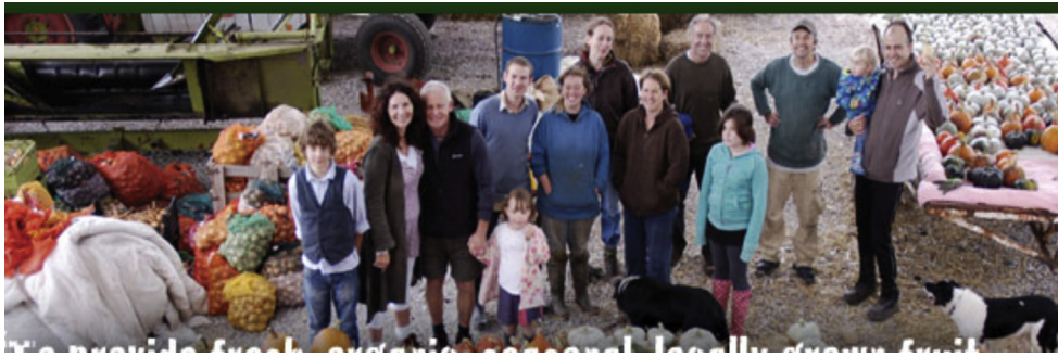
Fig. 8. Community, CSA 2.

days and work parties for example. The following quote demonstrates how one respondent feels Facebook promotes interaction.