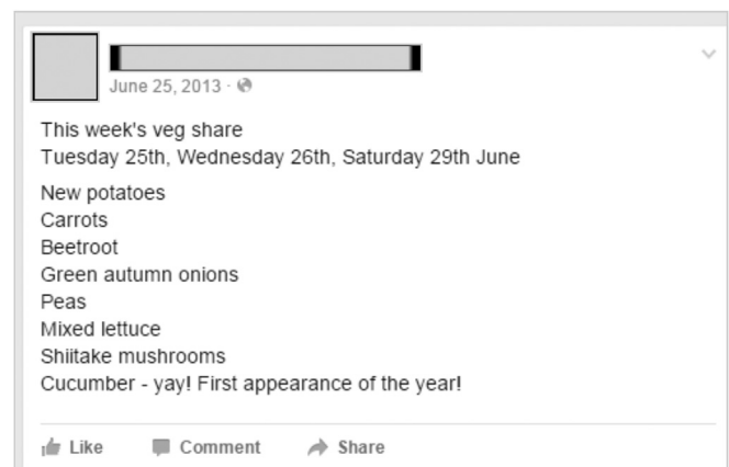
Fig. 5. Vegetable share contents on Facebook, CSA 2.