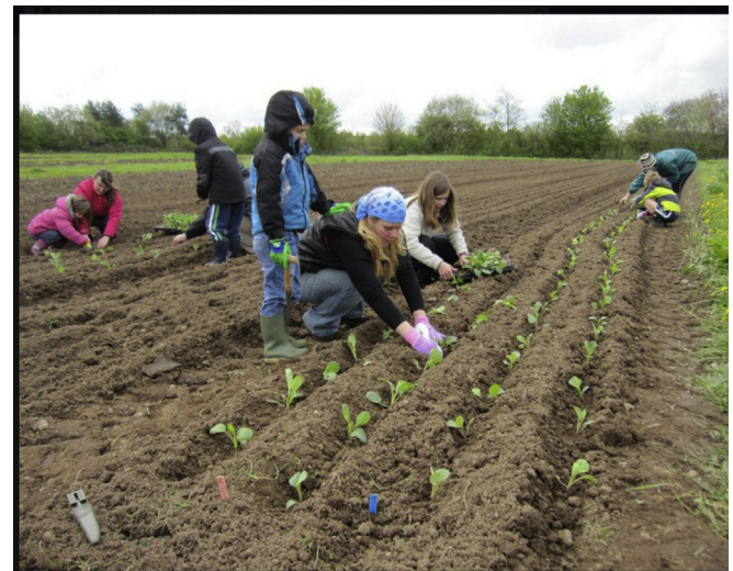
Fig. 7. 'Work day', CSA 1.

For the more CFN-orientated schemes groups of people collectively working, including families and children are present; such imagery presents notions of existing (offline) community and harmonious relationships (Figs. 7 and 8). Online spaces are therefore able to generate such notions, which contribute to the (re) creation of material spaces in an online capacity.