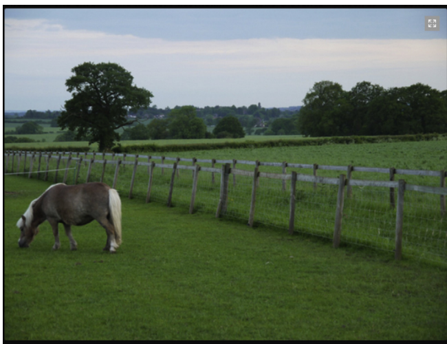
Fig. 9. 'Rurality' on website, Farm Shop 1.

Whilst the websites are considered a useful one-way promo-