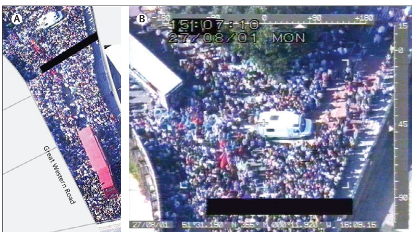
Figure 2: Notting Hill Carnival

(A) Pilgrim crowds at the Jamarat bridge. (B) Overcrowding preventing the access of an ambulance.