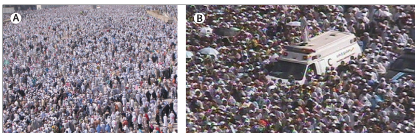
Figure 1: The Hajj

Crowd research has been going on since at least the 1890s when Gustave Le Bon 21 studied the psychology of crowds by observing how they formed. Crowd behaviour is generic and Isaac Newton generalised its dynamics when referring to the “madness of crowds” during the financial crisis of the South Sea Bubble in the early 18th century. 22 However, about 40 years ago, quantitative methods started to be used for crowd research, based on experiments under controlled conditions, to measure the effect of architectural configurations in buildings and streets on the flow of people, 23 and study the video recordings of crowds. 24 However during the past 20 years, more advanced quantitative techniques have