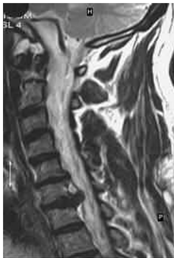
Figure 1 Preoperative MRI of the cervical spine, T2-weighted image, sagittal section showing a posterolaterally prolapsed C6–7 disc.